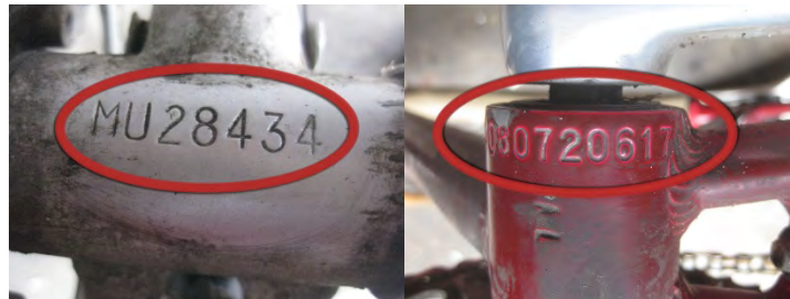
Examples of bike serial numbers

The serial number is your bike's unique identifier. Almost every bike has a serial number. Registering your bike with your serial number helps identify your bike in the event that it is lost or stolen. The serial number is typically engraved into the frame of the bicycle. Serial numbers are never placed on stickers or on parts of the bike that can be easily removed (such as pedals or handlebars).